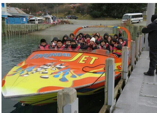
An Activity in NZ

When I was in 10 th grade in 2015, I participated in the New Zealand program. To make a long story short, it was the best and most brilliant