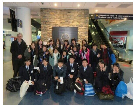
One photo in Airport (NZ)

Our school has a three-week short stay program in New Zealand and Australia during summer vacation to allow our students the experience of homestay, school life and language training in another country. It is fantastic experience to come into contact with living English, and brush up our English skills. These experiences give us confidence and are a true-life asset that we always carry with us. We are able to increase the flexibility of our thinking by living in a foreign country and a different environment.