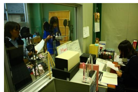
Offered by the Photo Club