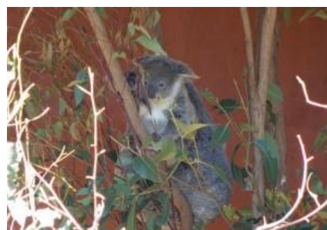
Koala in Lone Pine Koala Sanctuary

When I was in 10 th grade in 2015, I participated in the New Zealand program. To make a long story short, it was the best and most brilliant